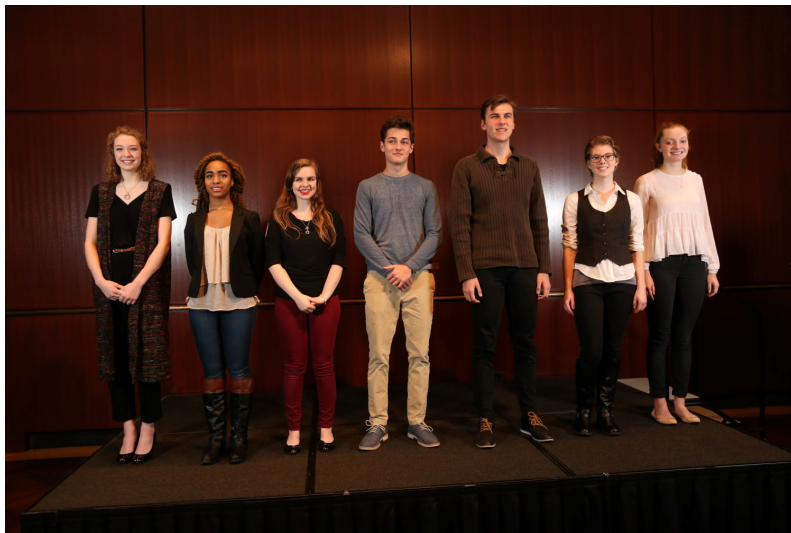
2017 Chicago Finalists

The winner will represent Chicago at the National Finals held at Lincoln Center, New York in May 2018.