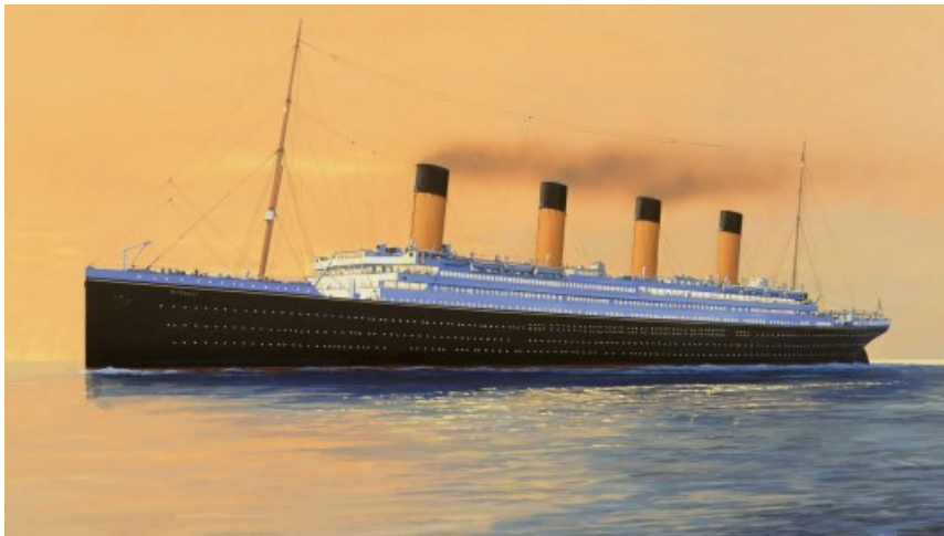
RMS TITANIC Length: 882 feet, 9 inches Height: 104 feet

Sound effects used in this production may include materials created by users of Freesound.org, which are used under a Creative Commons license. Due to printing deadlines, we cannot credit individual users here. Please see our sound designer for an up-to-date list of contributors and effects.