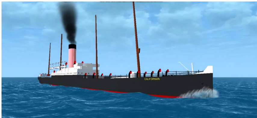
SS CALIFORNIAN Length: 447 feet Height: 53 feet